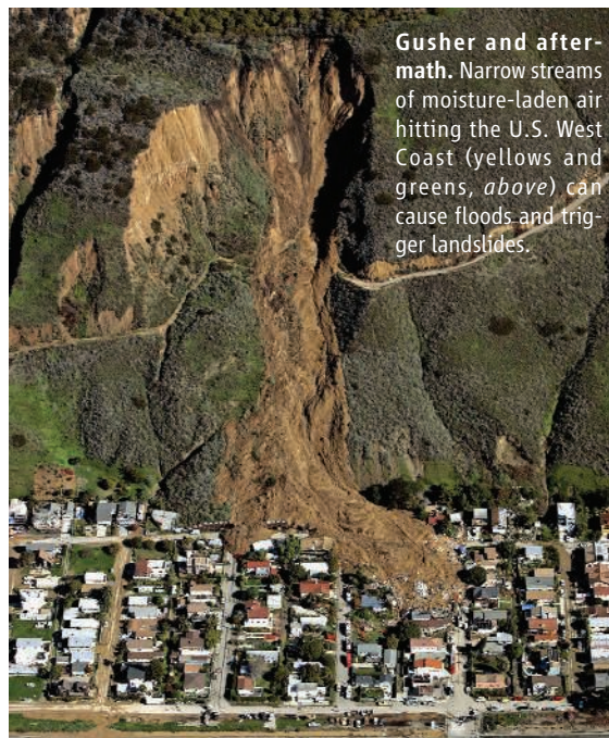
Gusher and aftermath. Narrow streams of moisture-laden air hitting the U.S. West Coast (yellows and greens, above) can cause floods and trigger landslides.

Laboratory in Boulder, Colorado, and his colleagues showed just how narrow atmospheric rivers really are. By parachuting instrument packages along a line across the cold fronts of 17 storms, they found that the core of a river—a jet of 85-kilometer-per-hour wind centered a kilometer above the surface—is something like 100 kilometers across. But the river is so moist that it moves about 50 million liters of water per second, equivalent to a 100-meter-wide pipe gushing water at 50 kilometers per hour.